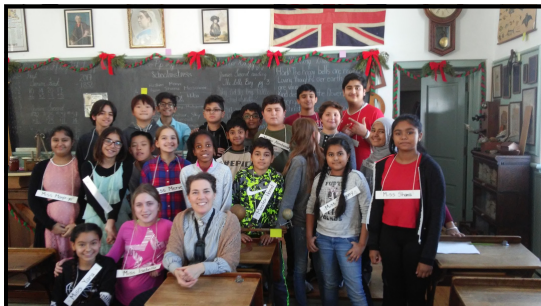
Fairwind Grade 6 Class

It was a day Class 604 will never forget, and I know Fairwind Grade 6 class walking trips to the Britannia Schoolhouse will become an annual tradition!