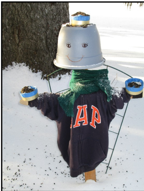
Our Don't Be Scared Crow

This year we've also set up what to most people looks like a child sized scarecrow. In fact, it is what I like to call a "don't be scared crow". Dressed like a student in winter, our "scarecrow" has a small metal tin attached to each hand and the top of its head. We fill these with bird seed and before long, the birds find their new feeding station. Because it looks like a person holding their hands out, when we then go outside with students and put seed in our hands, the birds come and eat right out of our hands! Chickadees are the bravest. Occasionally a little nuthatch or woodpecker will muster enough courage and trust us to land. The students of course are absolutely mesmerized by the experience. At Jack Smythe, where Lisa and I also work, feeding the chickadees is always part of the winter fun for visiting students. With a little luck and patience they may be able to experience that at the Schoolhouse as well!